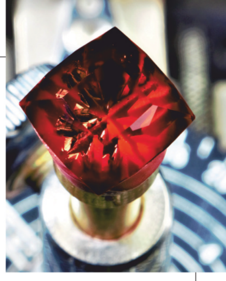
The finished Nautical Star, 8.88 carats of Oregon sunstone, faceted and carved by Dalan Hargrave, ready to be put into jewelry.