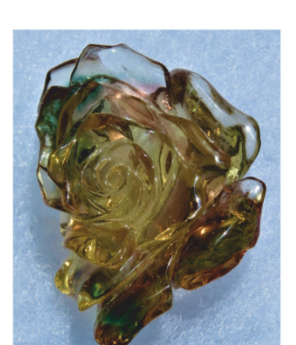
This custom cut stone displays both red and peach coloration.

Carved in sunstone from the Dust Devil mine in Oregon, this rose, cut by lapidary David Gray, displays a variety of colors.